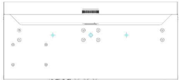
▲The bottom plate of the 4000 series - 1/4" UNC in the middle and M6 screw holes

The VE unit can be mounted via a 1/4" UNC threaded hole in the middle of the bottom plate to a tripod head for portable use. However, a common way of mounting the VE to a UTM is using two M6 screw holes with a 165 mm vertical span securing the system in a fixed position.